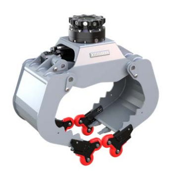
optional 4-Grip gripping device, here mounted to a A09H