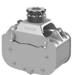
optional bolt-on side walls